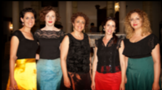
DeMusica Ensemble female vocal group